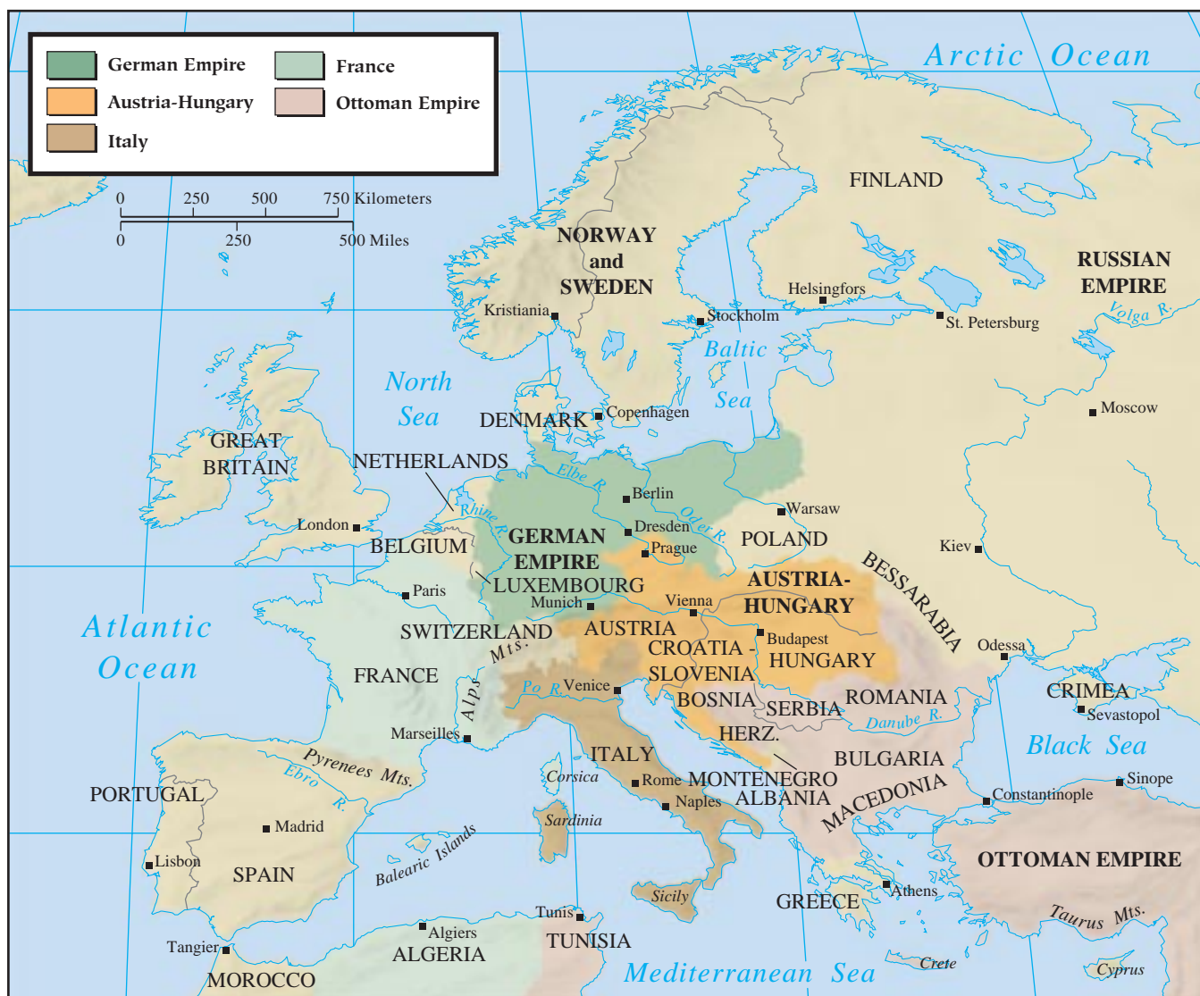
MAP 22.4 Europe in 1871.

The extension of the right to vote had an important by-product as it forced the Liberal and Conservative Parties to organize carefully in order to manipulate the electorate. Party discipline intensified, and the rivalry between two well-established political parties, the Liberals and Conservatives, became a regular feature of parliamentary life. In large part this was due to the personal and political opposition of the two leaders of these parties, William Gladstone (1809–1898) and Disraeli.